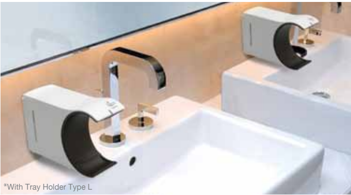
*With Tray Holder Type L