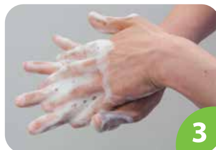
Right palm over left dorsum with interlaced fingers and vice versa