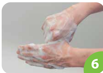
Rotational rubbing of left thumb clasped in right palm and vice versa