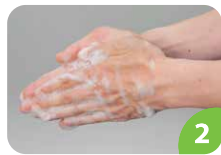
Rub hands palm to palm