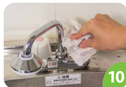
Use towel to turn off faucet