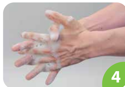
Palm to palm with fingers interlaced