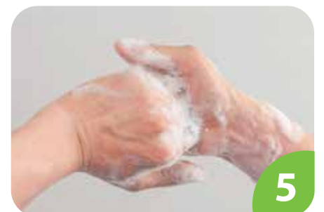
Backs of fingers to opposing palms with fingers interlocked