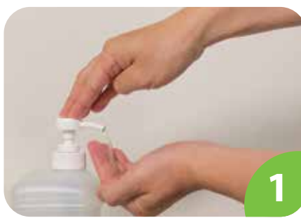
Apply enough soap to cover all hand surfaces