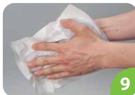
Dry hands thoroughly with a single use towel