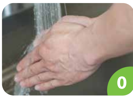
Wet hands with water