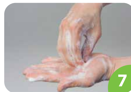
Rotational rubbing, backwards and forwards with clasped fingers of right hand in left palm and vice versa